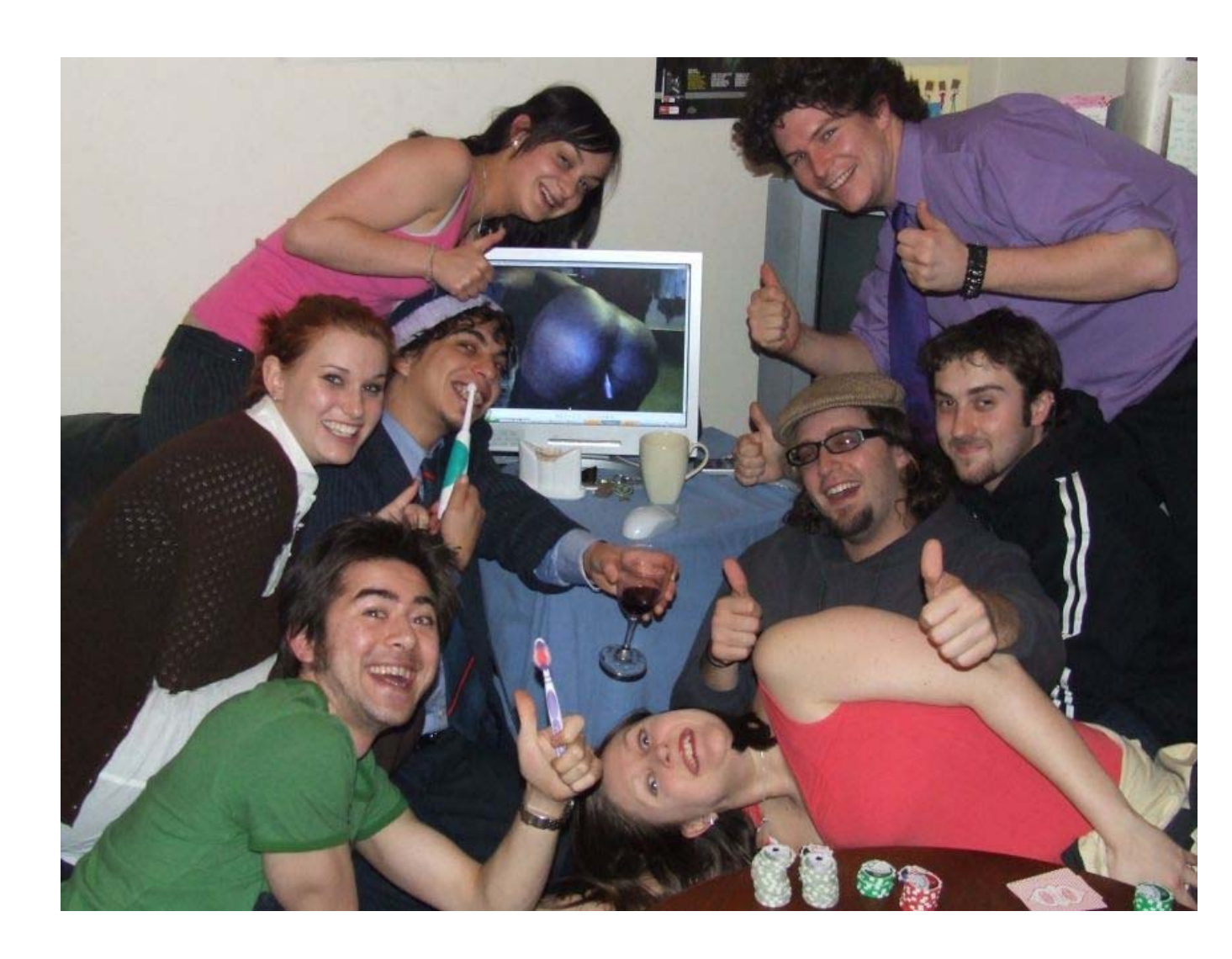
Transfer of "OWNED1.jpg" is complete.