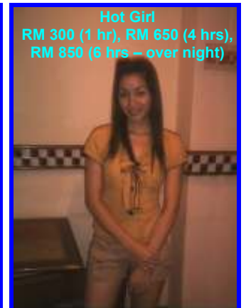
Hot Girl RM 300 (1 hr), RM 650 (4 hrs), RM 850 (6 hrs – over night)